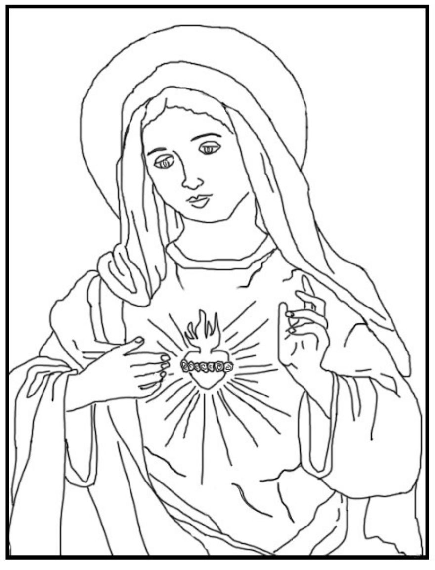
Immaculate Heart of Mary