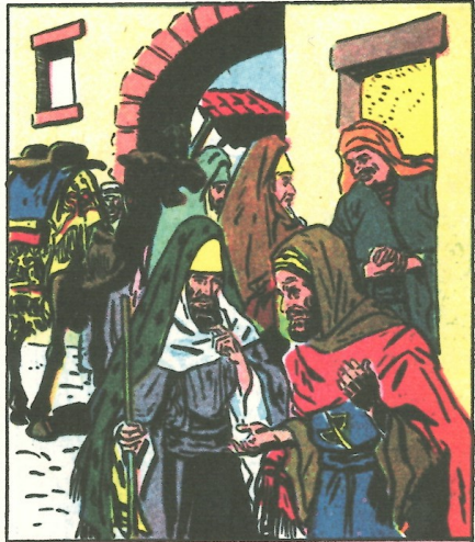
JOSEPH SEES THEM TO THE INN— BUT HE IS AFRAID. HEROD IS WELL-KNOWN FOR HIS JEALOUS HATE.