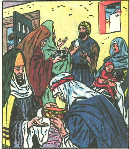
GOLD, FRANKINCENSE, AND MYRRH ARE THEIR GIFTS. MARY SEES SYMBOLS OF KINGSHIP, DIVINITY, HUMANITY.