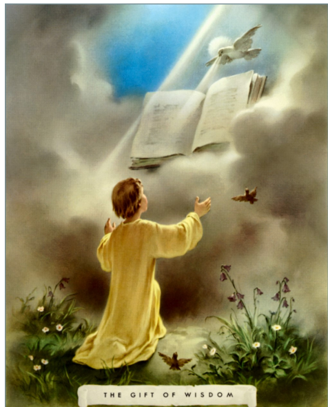
THE GIFT OF WISDOM