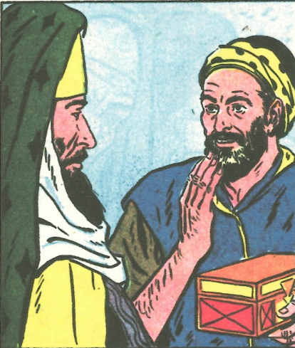
"HEROD AND THE PRIESTS TOLD US WHERE TO FIND YOU. WE ARE TO RETURN TO JERUSALEM WITH THE NEWS."