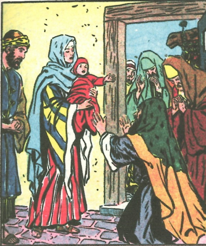
THEY HAVE TRAVELED MANY MILES JUST TO KNEEL BEFORE THIS KING OF KINGS AND THE QUEEN OF THE PROMISE.